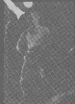
Zoltan Nagyvary Guitar

Described as the most explosive and powerful band to emerge from the southwest!