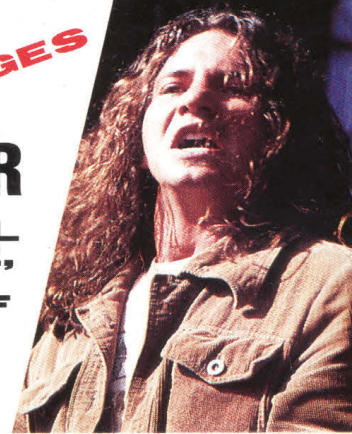
PEARL JAM'S EDDIE VEDDER